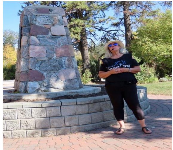
Storyteller at Memorial Park

As we look forward to our 5 th Theatre Season we wanted to share how we publicly thank the Memorial Presbyterian Church, an annual and cherished sponsor of the Theatre and we will continue to do so. The church is so deserving of acknowledgement for its ongoing contribution to the community, a goal shared by all of us.